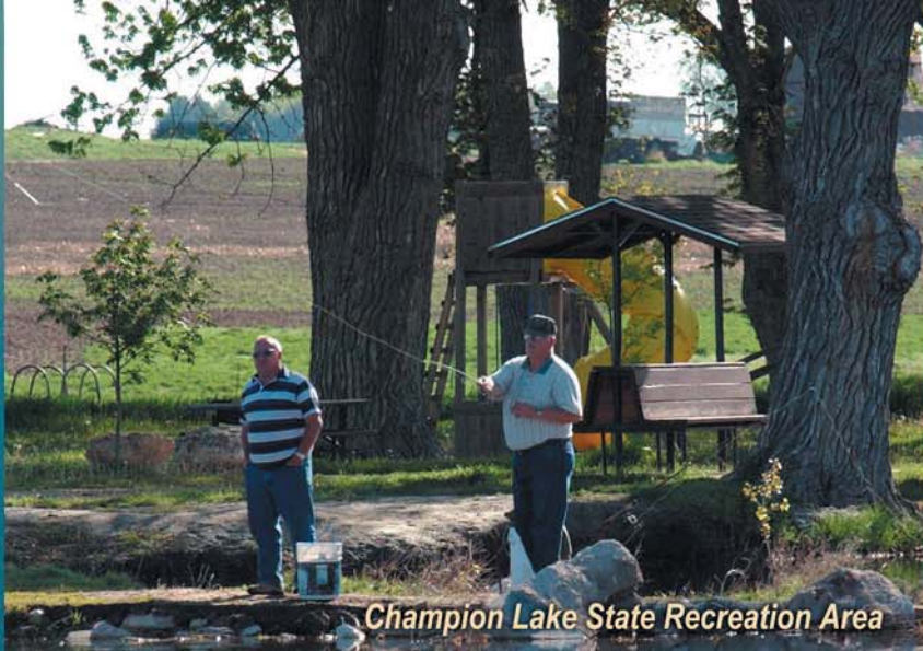
Champion Lake State Recreation Area

Warm weather brings the excitement of camping on a sandy beach, or if you prefer, bring your recreational vehicle and park on a pad with electrical hookups. Drinking water, ADA accessible showers and a sanitation station are available. While you're there, enjoy hiking and biking trails, numerous picnic areas and, if water sports interest you, Enders Reservoir is equipped with a concrete boat ramp.